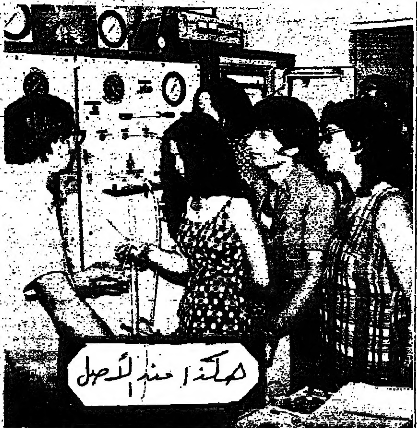
Youthful science enthusiasts from eight countries will work with Weizmann Institute scientists in the Fourth International Science Summer here, which opened Friday in Rehovot.

The participants, who have been divided into groups specializing respectively in biology, physics, chemistry and mathematics, will spend the first two weeks of their visit working side by side with experienced scientists in Weizmann Institute laboratories. They will, in addition, hear scientific lectures by senior members of the Institute's staff as well as talks by outside experts on such subjects as archeology, the kibbutz and Israel's aircraft industry. Time is also set aside for swimming, camping and an evening of jazz. At the end of the first two weeks, the overseas visitors will take part in a variety of special programmes, devoted to various aspects of ecology, while archaeolo-